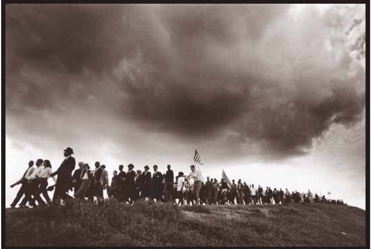
The Selma-to-Montgomery March for Voting Rights in 1965 helped end one injustice, but pockets of injustice remain.

“Through the process of amendment, interpretation, and court decision, I have finally been included in ‘We the people.’” Barbara Jordan